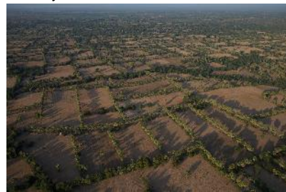
Agroforestry inter-parcel model.

Agroforestry is a land use management system in which trees or shrubs are grown around or among crops or pastureland. It combines agricultural and forestry technologies to create more diverse, productive, profitable, healthy, and sustainable land-use systems.