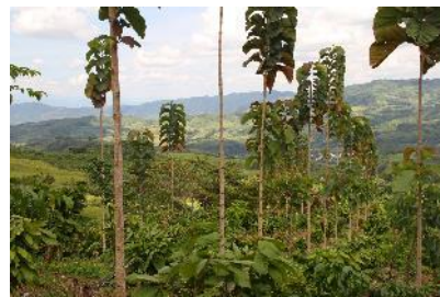
Agroforestry intra-parcel model.