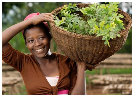
Nursery logistics during planting wave in Ethiopia