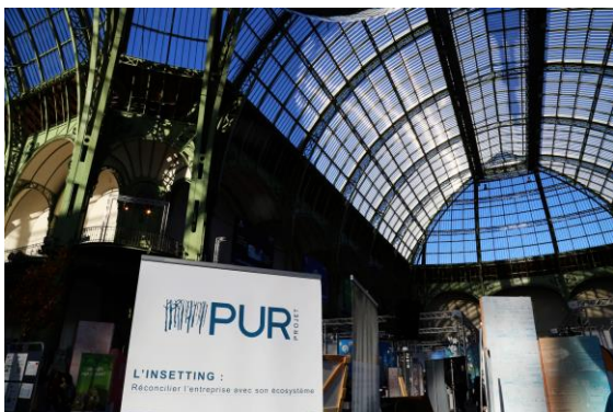
PUR Projct stand during COP21 side event