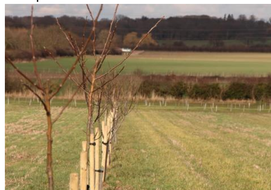
Agroforestry parcel from project in UK