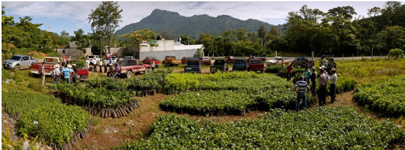
Organization of planting wave in Guatemala

A short selection of pictures is proposed here to get a feeling of the essence of our activities and share the passion that drives us.