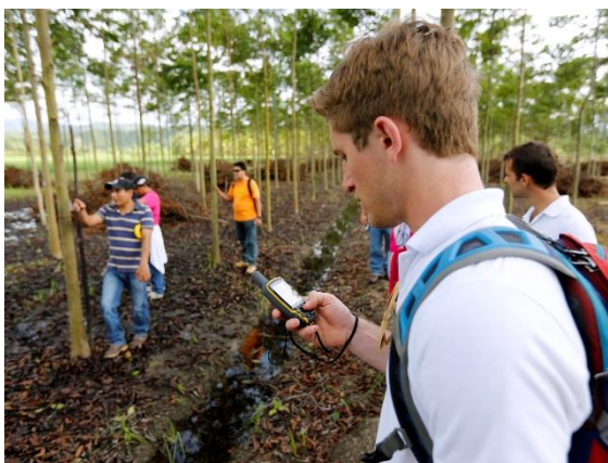
Monitoring activities in Peru